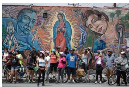
V. El Este de Los Angeles