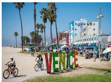
I. The Beaches