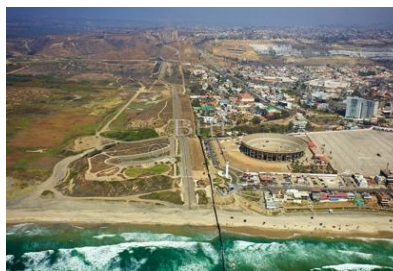
VII. The Macro-Frontier