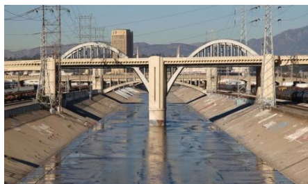
VI. L.A. River