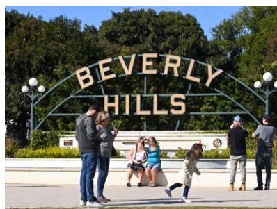
II. The Hills