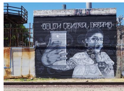
III. The Flatlands: South Central/San Fernando Valley